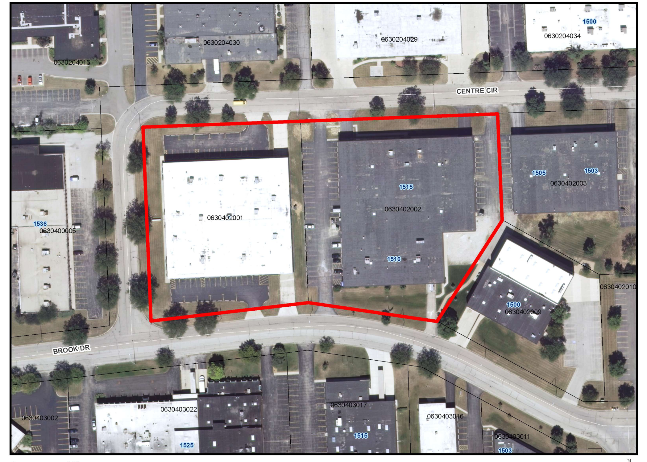
\stackrel{\scriptscriptstyle{100}}{=} Feet 1528 Brook Drive and 1516 Brook Drive / 1515 Centre Circle Location Map \stackrel{\scriptscriptstyle{100}}{\downarrow}