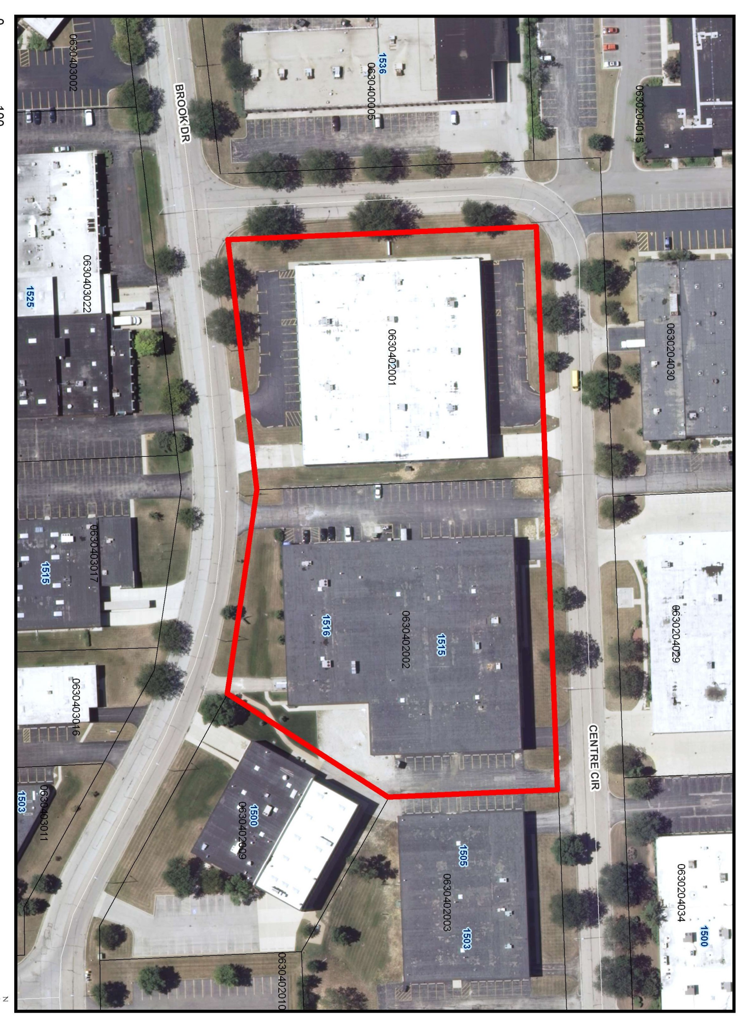
1528 Brook Drive and 1516 Brook Drive / 1515 Centre Circle Location Map