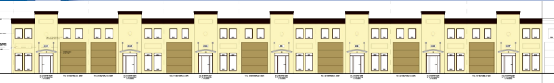
BUILDING 2 SOUTH ELEVATION SCALE: 1/8" = 1'-0"