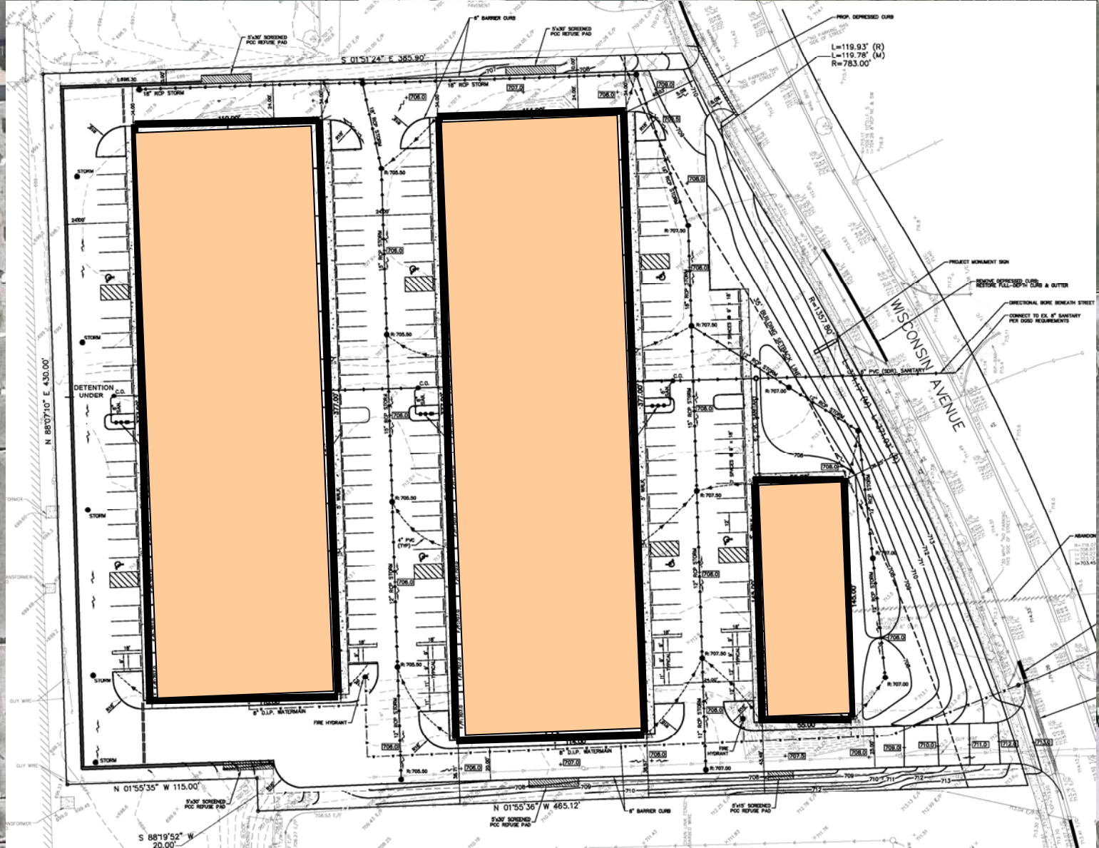
PROPOSED SITE LAYOUT