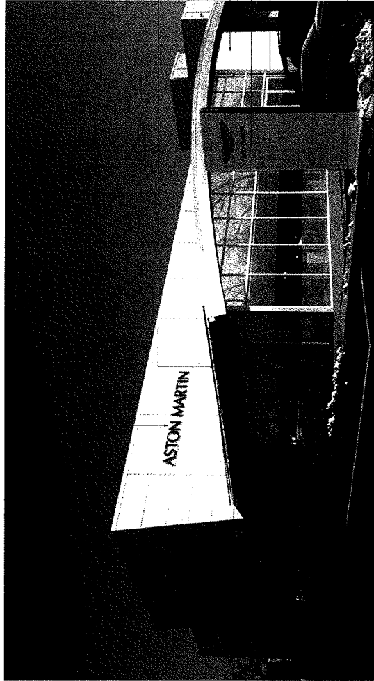
PROPOSED EXTERNAL TREATMENT VISUAL

SIGNAGE ASTON MARTIN HALO ILLUMINATED BRAND MARQUE WINGS APPLIED TO EXISTING WHITE FACADE (SAB8) BUILDING. ASTON MARTIN HALO ILLUMINATED LETTERS APPLIED TO NEW WHITE BRAND WALL. ASTON MARTIN CI PAVING APPLIED TO EXISTING GLAZING. PROPOSAL FOR NEW TRANVERTINE 4.5M HIGH CI BRAND PYLON.