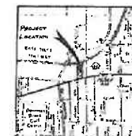
LOCATION MAP No Scale

BEACHVIEW AT THE SOUTH EAST CORNER OF SAID LOT 2. SAID S. E. CORNER CORRESPONDS WITH THE CURVE LINE OF OTHER AVENUE. THENCE SOUTH 87° 02' 00" WEST, 40 FEET, 40 MINUTES WEST, ON THE SOUTH LINE OF SAID LOTS 2 AND 3 AND THE CENTER LINE OF SAID GREEN AVENUE A DISTANCE OF 341.18 FEET, THENCE NORTH 5° 16' 00" WEST, 100 FEET, 10 MINUTES WEST, ON A LINE PARALLEL WITH THE EAST LINE OF SAID LOT 2, A DISTANCE OF 100 FEET, 10 MINUTES WEST, TO THE EAST LINE OF SAID LOT 2, THENCE NORTH 89° 00' 00" WEST, 100 FEET, 10 MINUTES WEST, TO THE EAST LINE OF SAID LOT 2, THENCE EASTERLY ON THE RIGHT-OF-WAY LINE BEING A CURVED LINE, CONVERSE 2° 18' 00" NORTH, HAVING A RADIUS OF 672.88 FEET A 180° DISTANCE OF 341.18 FEET TO THE EAST LINE OF SAID LOT 2, THENCE SOUTH 89° 00' 00" WEST, 100 FEET, 10 MINUTES WEST, TO THE EAST LINE OF SAID LOT 2, THENCE SOUTH 89° 00' 00" WEST, 100 FEET, 10 MINUTES WEST, TO THE POINT OF BEGINNING, IN DE PAGE COUNTY, ILLINOIS.