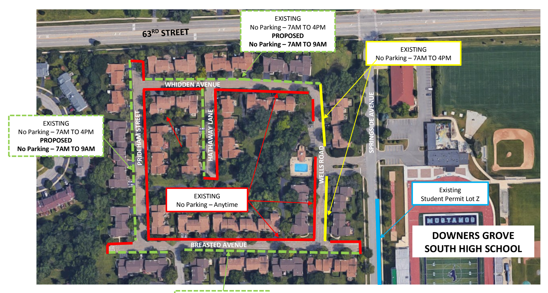
File #01-16 - Exhibit 1 Springside Condos "No Parking 7 am - 9 am" Parking:

EXISTING No Parking – 7AM TO 4PM PROPOSED No Parking – 7AM TO 9AM