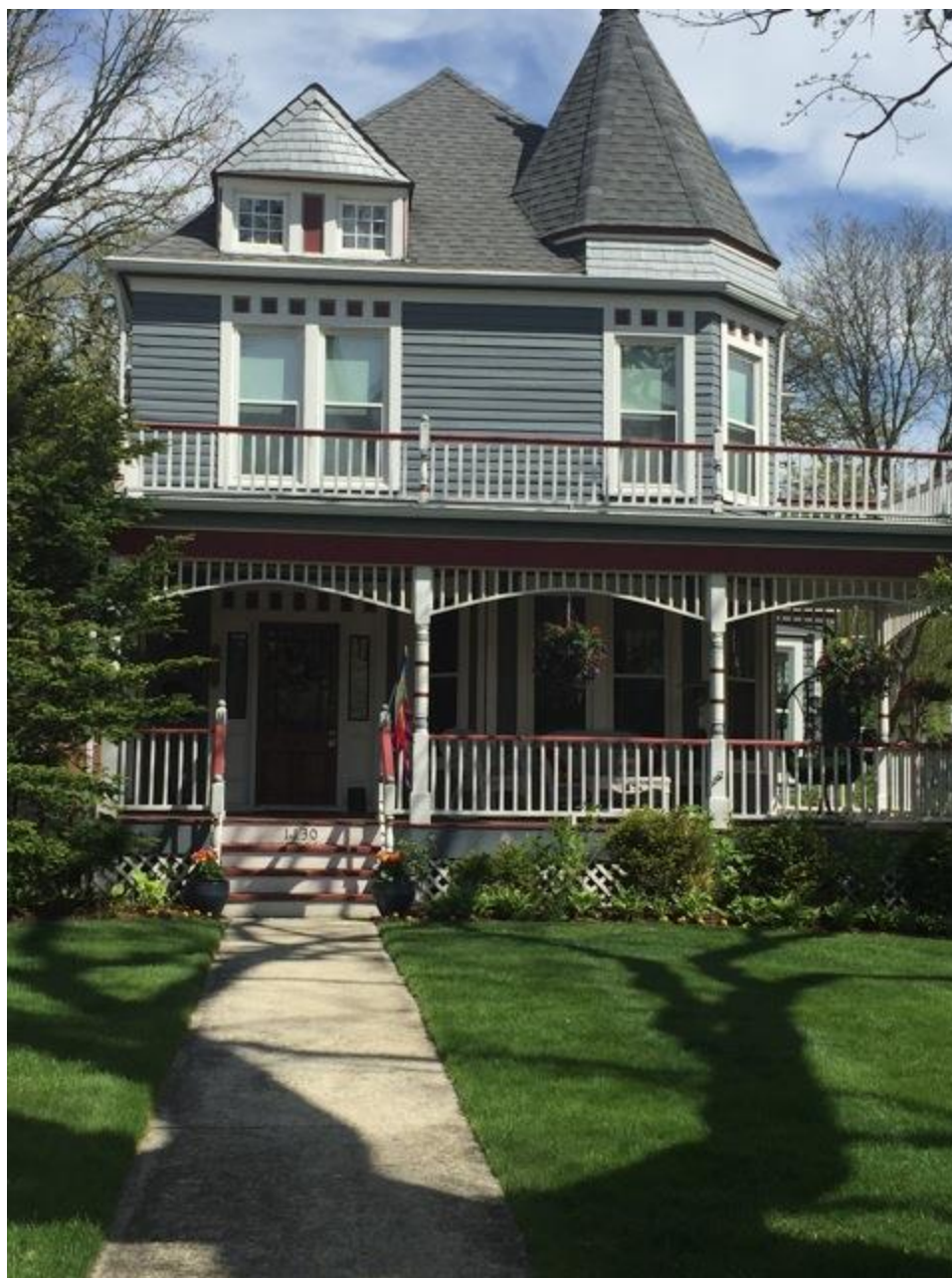
Front Side on Franklin Street facing South