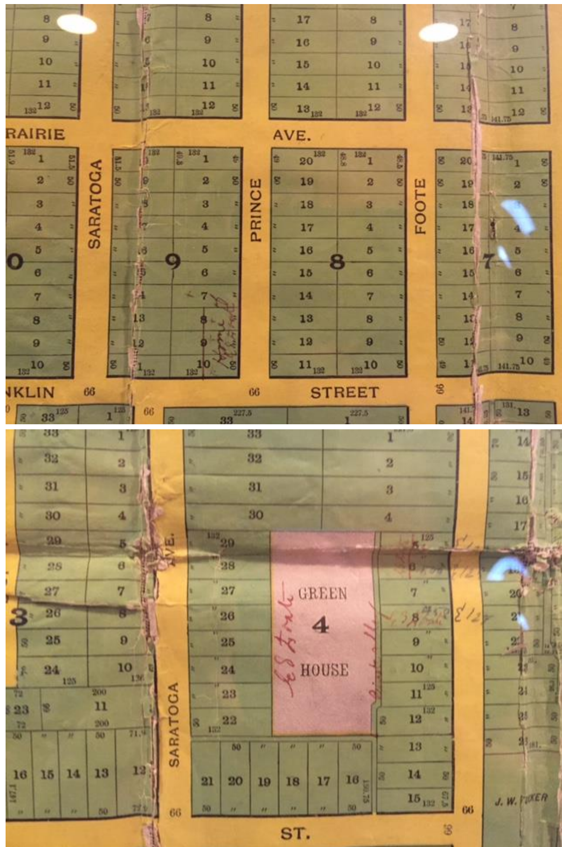
Map detail showing the location of the home and the greenhouse