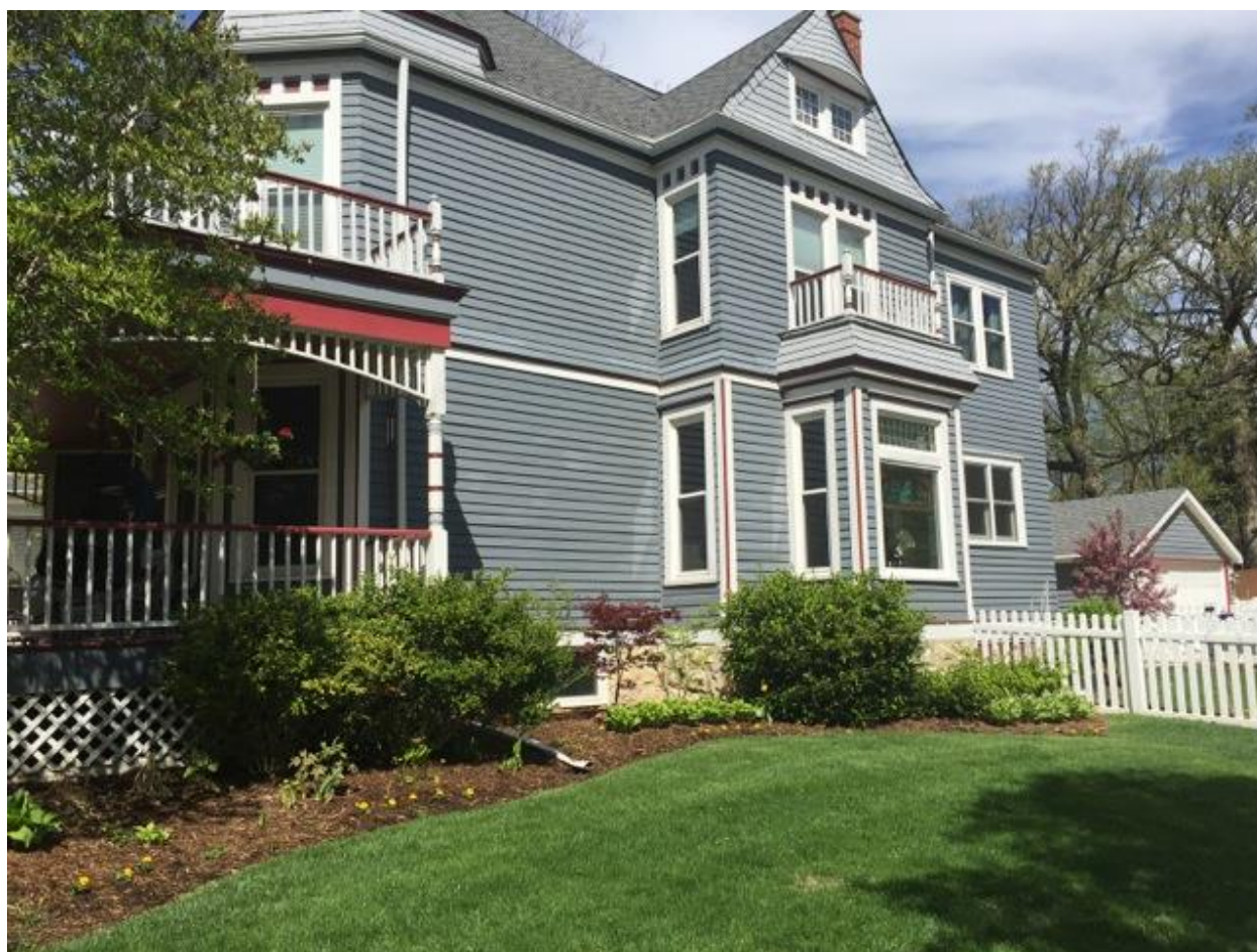
East Side facing Prince Street