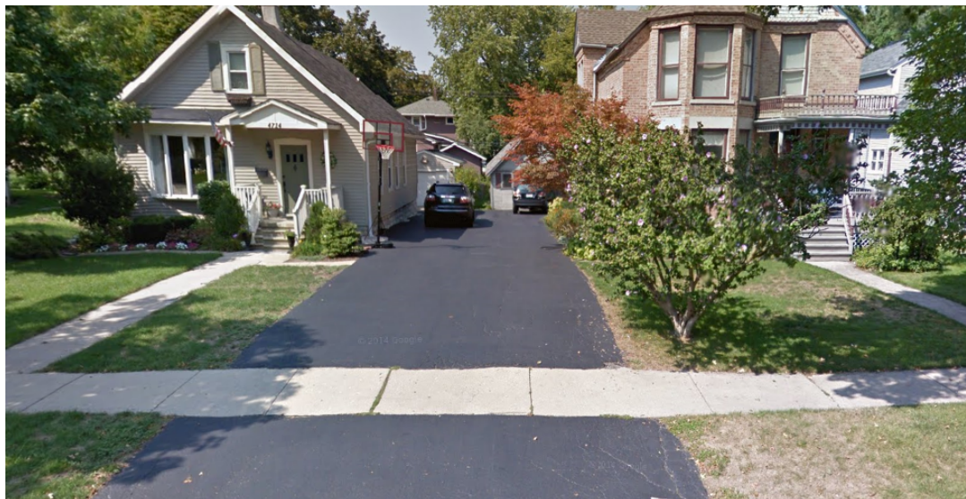
Figure 2 – 4710 Highland (right) & 4714 Highland (left) Shared Driveway