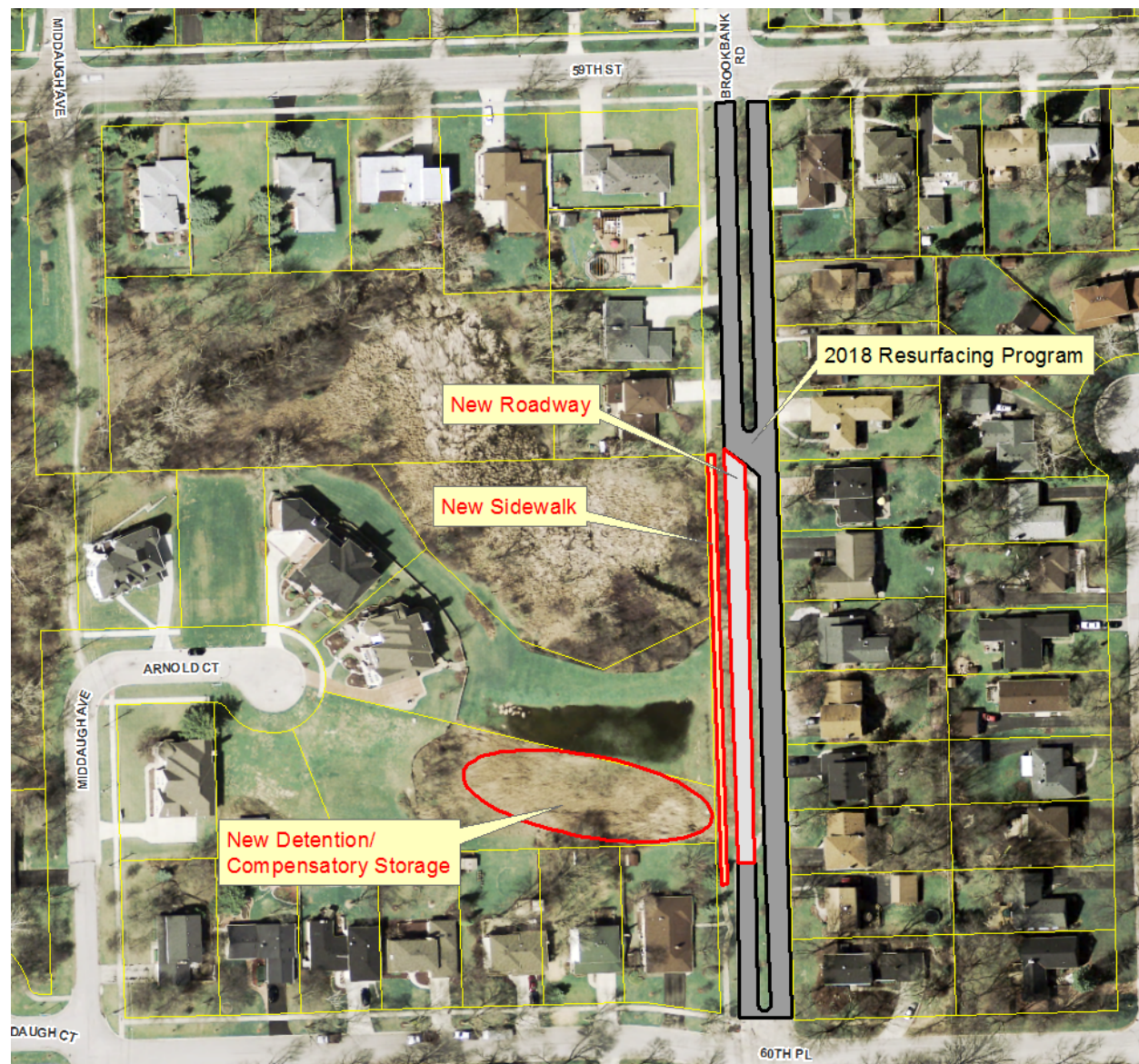
Project Location Map – Brookbank Road