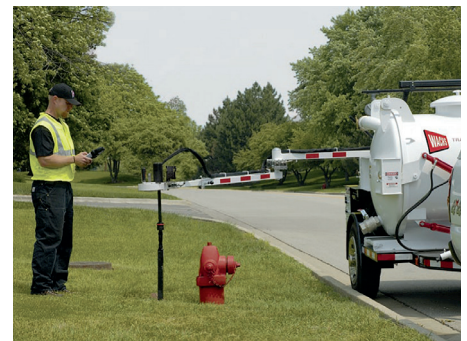
ERV-750 easily reaches any curbside valve box or hydrant within 13ft of the mount.