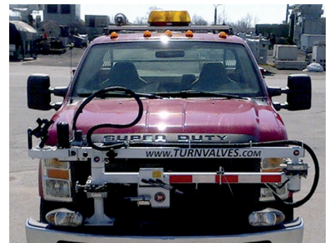
High stack version of the ERV-750 is available for bumper mounting.

*Requires ruggedized HC-100 controller/data logger with built-in GPS, sold separately.