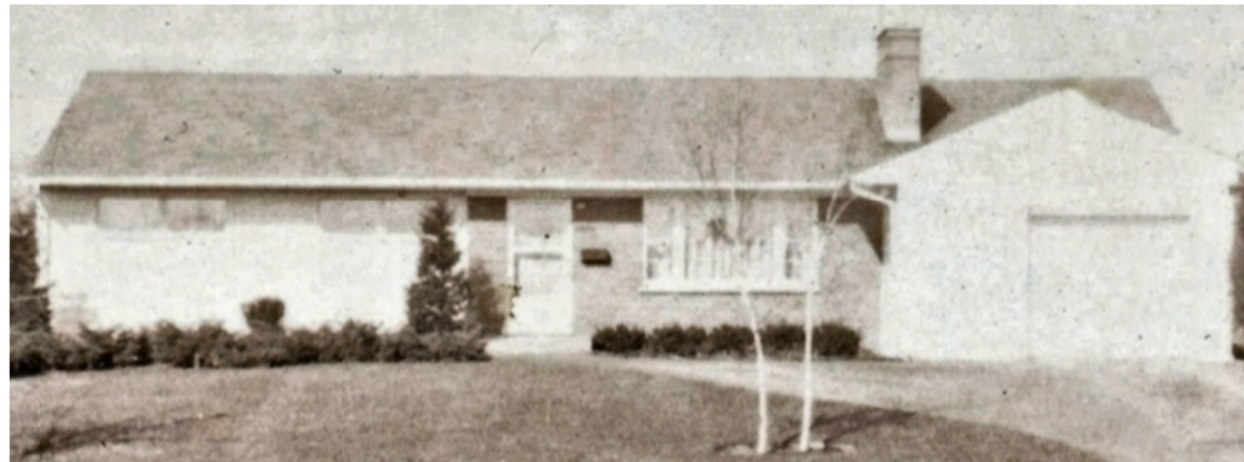
Detail of early Polaroid photograph, perhaps from the 1950's